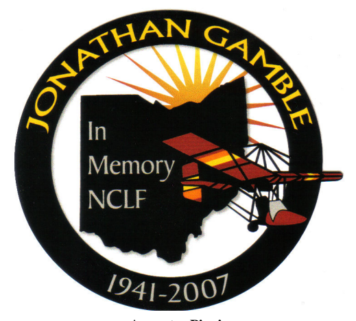
August = Picnic

August 7 is our Annual Picnic at Mayfield Airport this year. The picnic will start at 3:00 with food starting at 4:00. Burgers and Dogs will be provided by the club. Bring a covered dish if you can.